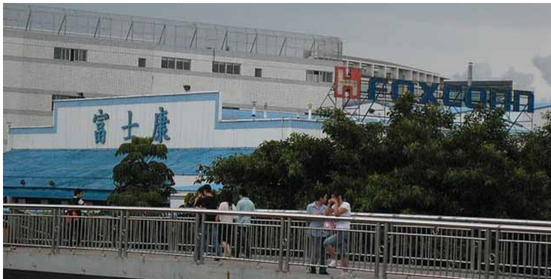
Footbridge outside southern gate of Longhua campus, Foxconn. One of the interview sites of SACOM investigations.

This report aims to reveal the actual working and living conditions of workers at Foxconn to mobilise public support for their struggle against their plight. Instead of ineffectively pleading corporations to restrain themselves against labour rights violations, SACOM urges concerned organizations, consumers, investors, and the government to join the workers to pressure electronic factories to deliver decent working conditions in the electronic industry.