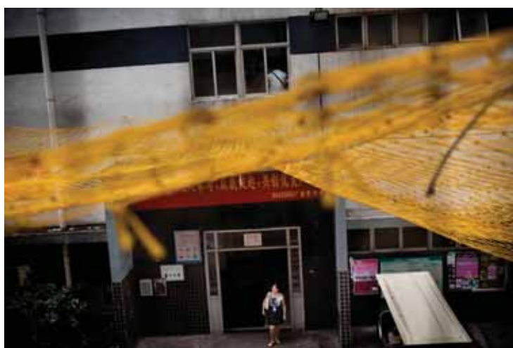
Upper: entrance of Foxconn campus Lower: safety net inside Foxconn campus