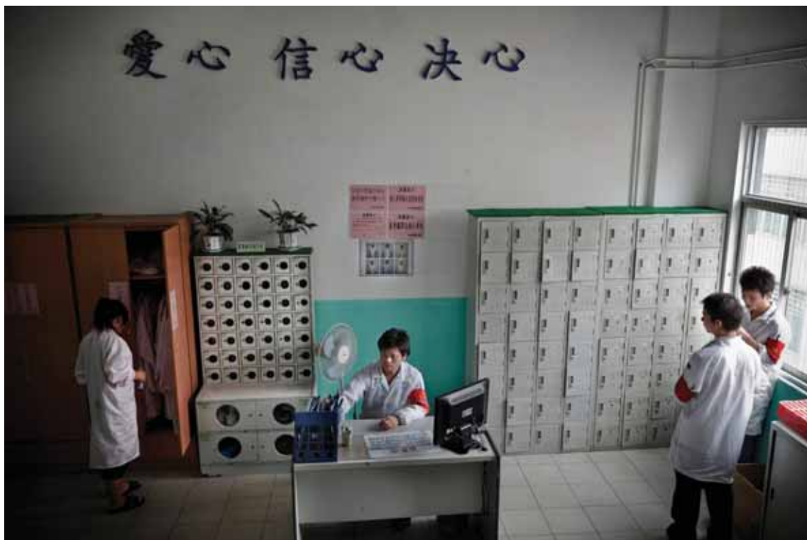
Area outside the shop floor where workers change their uniform. “Love, Confidence, Determination” is printed on the wall.

When asking workers what needs to be improved at Foxconn, most responded that frontline management should be more civil. Many interviewees reported that production line leaders did not have any skill in management, and that they would only yell at workers if there was