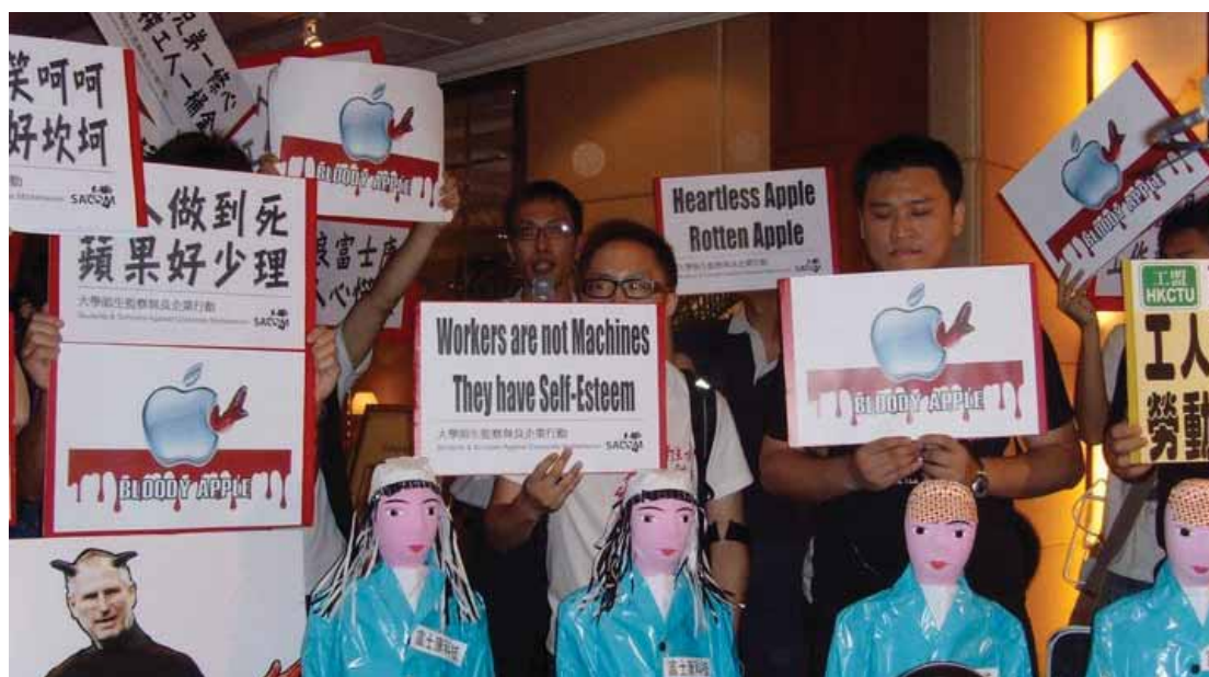
SACOM and other labour organizations in Hong Kong staged a protest outside the shareholder meeting of Foxconn on 8 June 2010.

In the Apple Supplier Code of Conduct, it states that workers will not be harassed, that working hours will be in compliance with local law, and that overtime work should be on voluntary basis. Disappointingly, these are merely promises on paper.